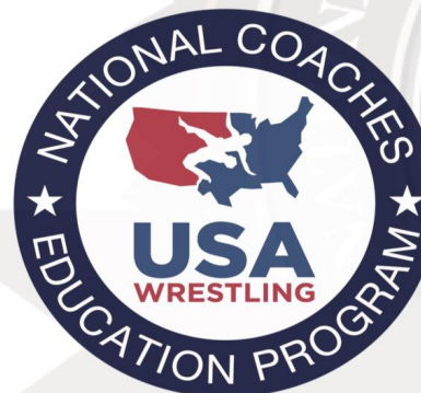
National Coaches Education Program Manager